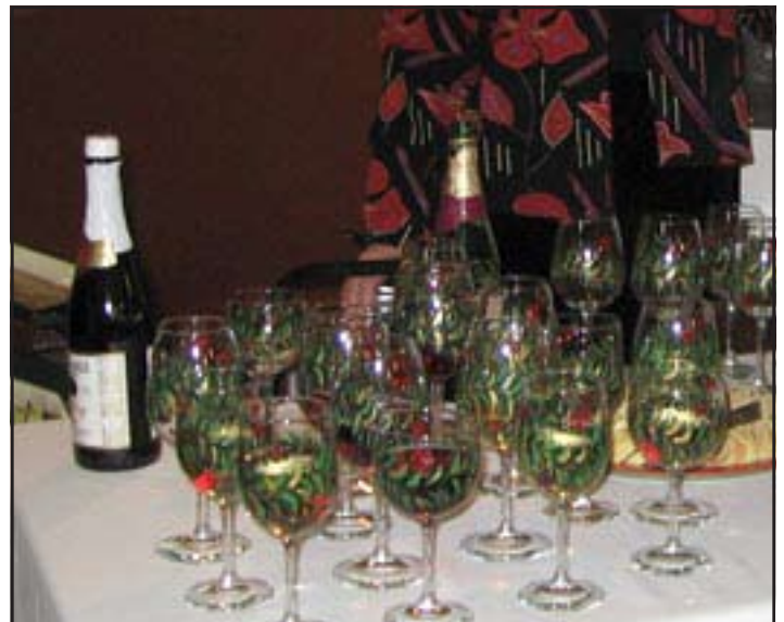
At the Dala of Mora BPW "Girls Night Out" on Dec. 12, guests were greeted with a hand-painted wine glass filled with their favorite wine or non-alcoholic beverage