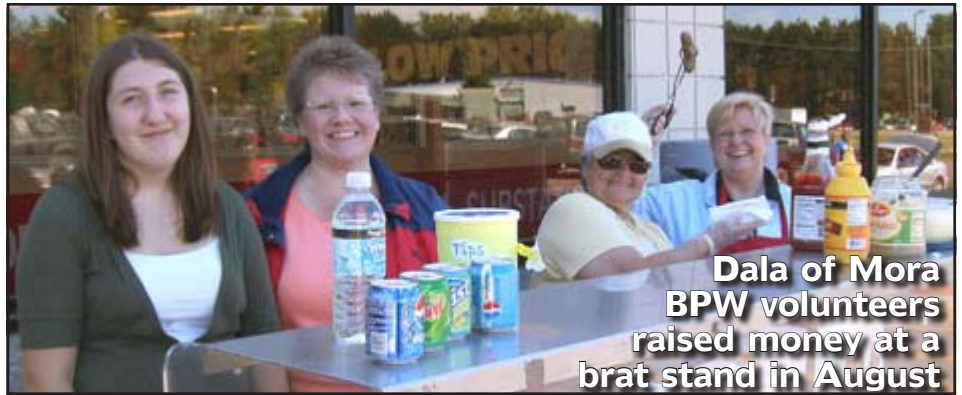
Dala of Mora BPW volunteers raised money at a brat stand in August