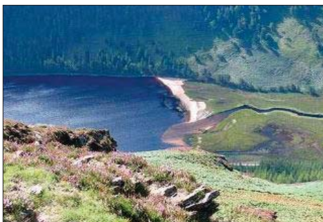
A good place to hike, south of Dublin