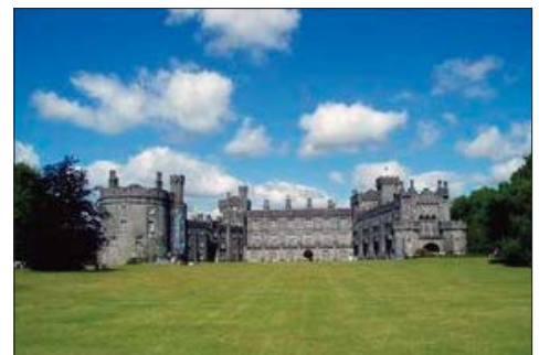
Kilkenny Castle – early November